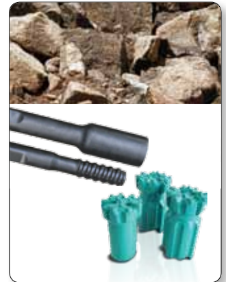
TOP HAMMER CONSUMABLE