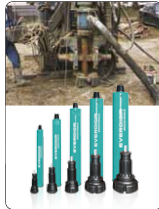
DOWN THE HOLE