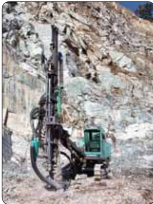
TOP HAMMER CRAWLER DRILL